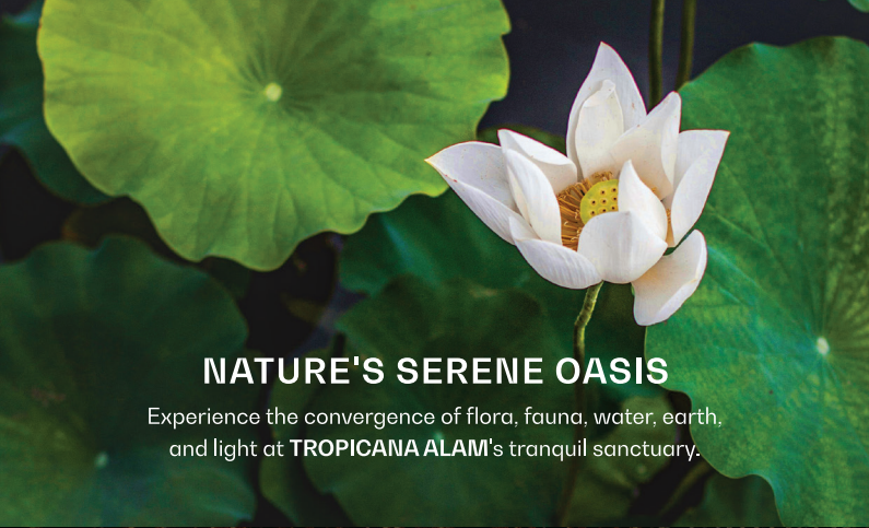
5-acre Scenic Lake

Experience the convergence of flora, fauna, water, earth, and light at TROPICANA ALAM's tranquil sanctuary.